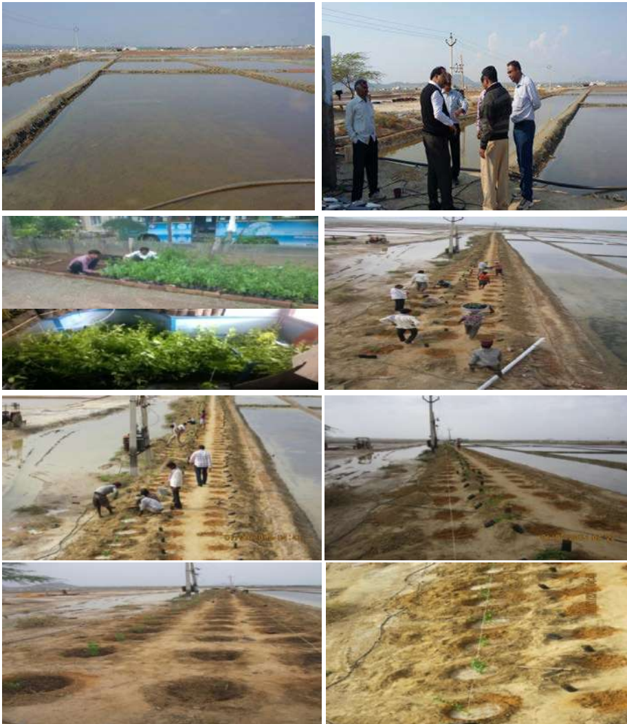
Activities on halophyte plantation at Salt Works in Rajasthan